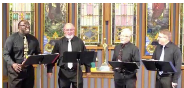
Sunday, August 20th, the Lincoln Harmonics were the special music at Dorchester United Methodist Church.