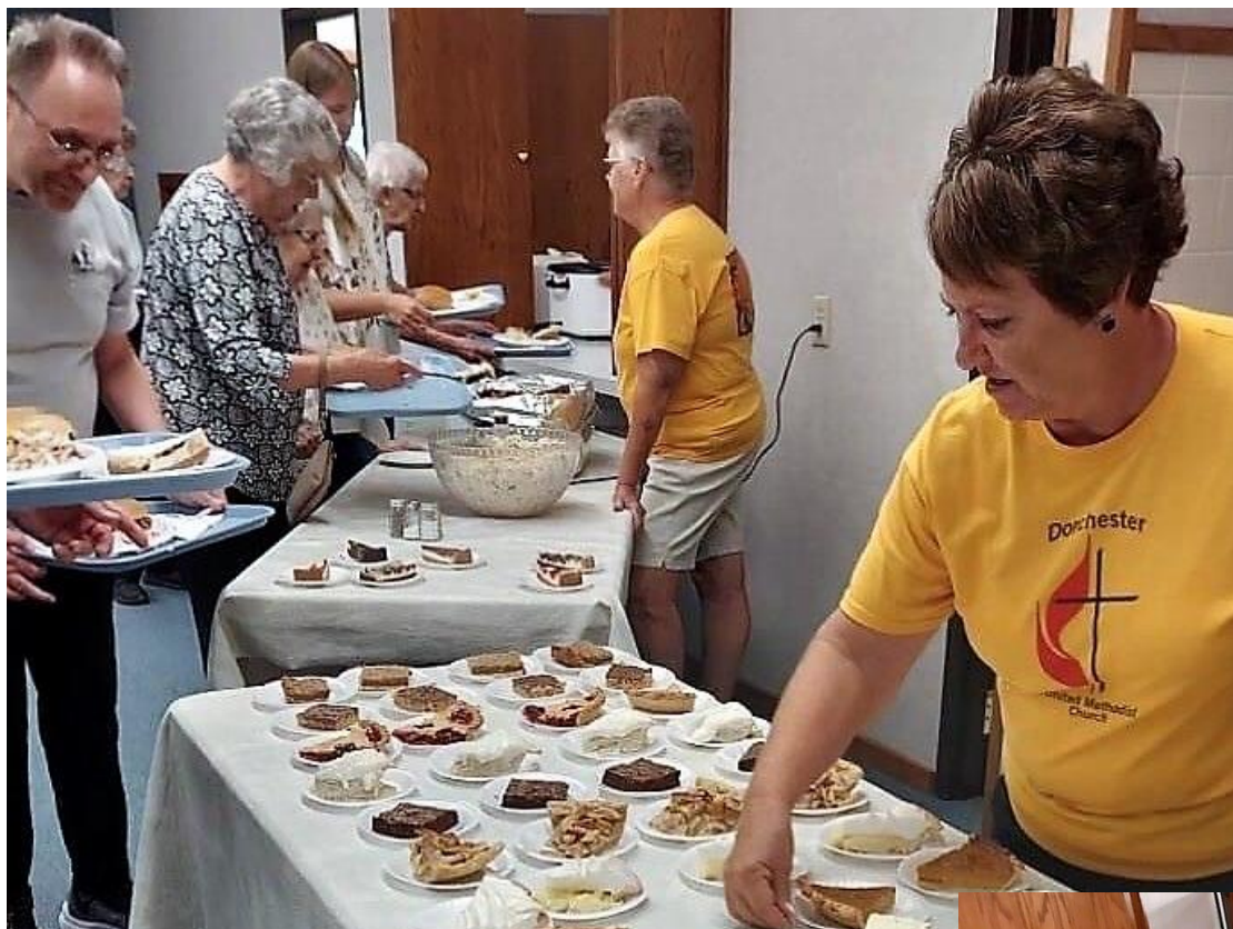
Dorchester United Methodist Church BBQ Sunday September 18, 2022

Dorchester Worship Service-9:30 am Dorchester Sunday School 10:15-10:45 am Friend Worship Service-10:30 am Friend Sunday School 9:30-10:15 am at FUMC